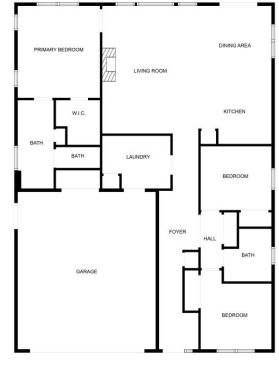
BIG SKY HEAGUREMENTS ARE CALCULATED BY CUBICASA TECHNOLOGY, DELMEC HIGHAY, RELINELE BUT NOT GUARANTEED.