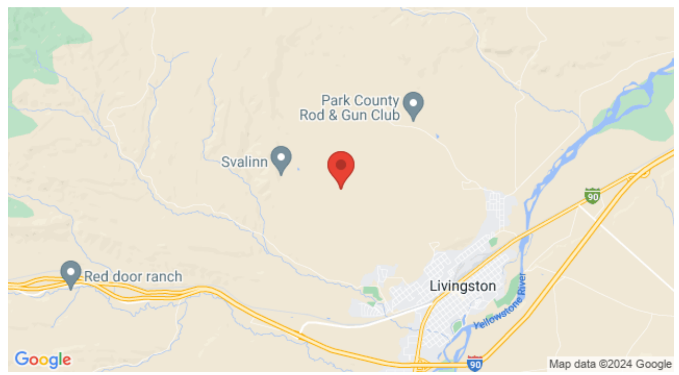
Address: 16 Pronghorn Trail, Livingston MT 59047