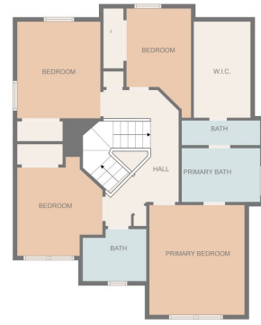
BIG SKY REAL ESTATE MEASUREMENTS ARE CALCULATED BY CURCASA TECHNOLOGY. DESIRED HIGHLY RELIABLE BUT NOT GUARANTEED.