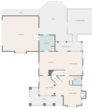
BIG SKY REAL ESTATE MEASUREMENTS ARE CALCULATED BY CURCASA TECHNOLOGY. DESIRED HIGHLY RELIABLE BUT NOT GUARANTEED.