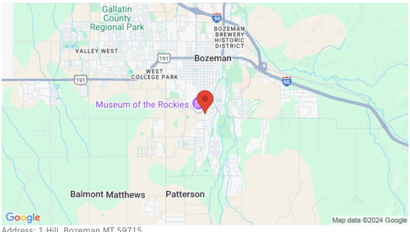
Address: 1 Hill, Bozeman MT 59715