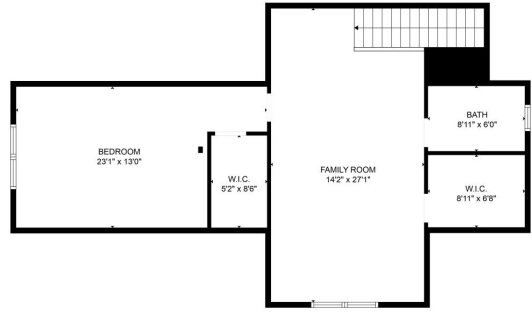
BIG SKY FLOOR PLAN CREATED BY CURICASA APP. MEASUREMENTS DEEMED HIGHLY RELIABLE BUT NOT GUARANTEED.