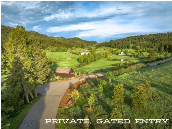
PRIVATE, GATED ENTRY