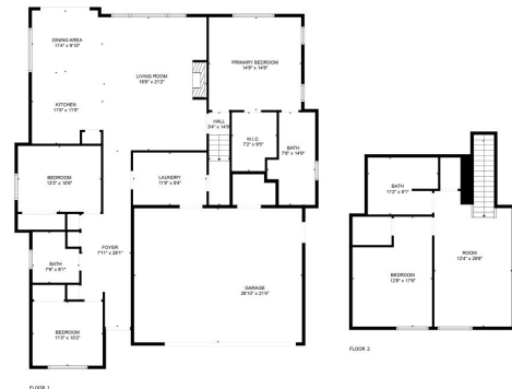
BIG SKY REAL ESTATE FLOOR PLANS CRAFTED BY CIBICOGA A/E/P. MEASUREMENTS DEEMED HIGHLY RELIABLE BUT NOT GUARANTEED.