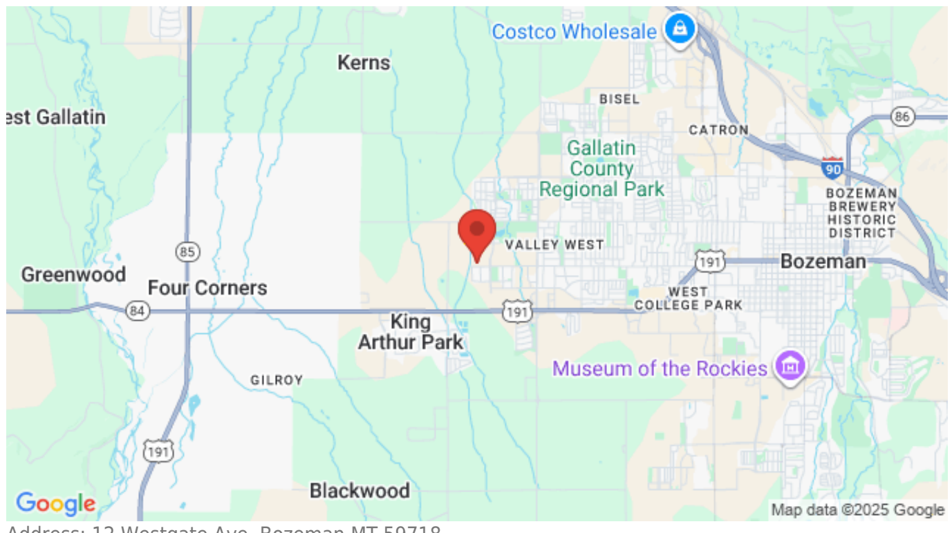
Address: 12 Westgate Ave, Bozeman MT 59718