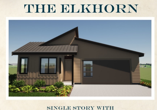
SINGLE STORY WITH THREE BEDROOMS & TWO BATHS BIG SKY 1,658 SQUARE FEET