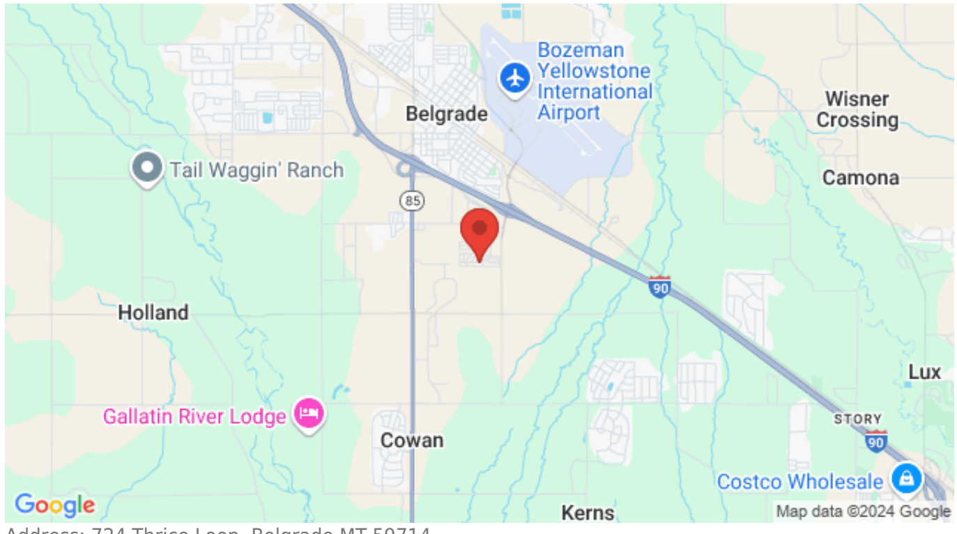
Address: 724 Thrice Loop, Belgrade MT 59714