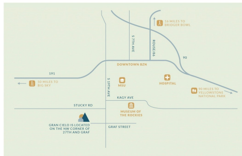
Located in the heart of Bozeman's south side, Gran Cielo is conveniently located to both the energy of downtown and the serenity of nature.