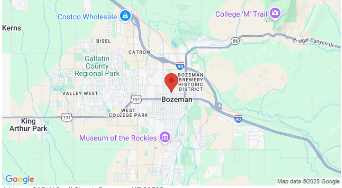
Address: 217 W Beall Street, Bozeman MT 59715