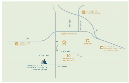
BIG SKY Located in the heart of Bozeman's south side, Gran Cielo is conveniently located to both the energy of downtown and the serenity of nature.