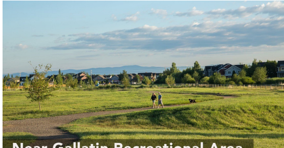
Near Gallatin Recreational Area, Ponds & Dog Park