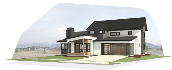
1 PROJECT IMAGE BIG SKY FLANDERS MILL HOUSE AT 1460 WINDROW DRIVE