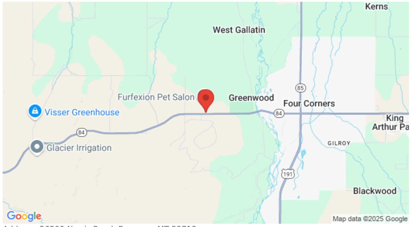
Address: 26509 Norris Road, Bozeman MT 59718