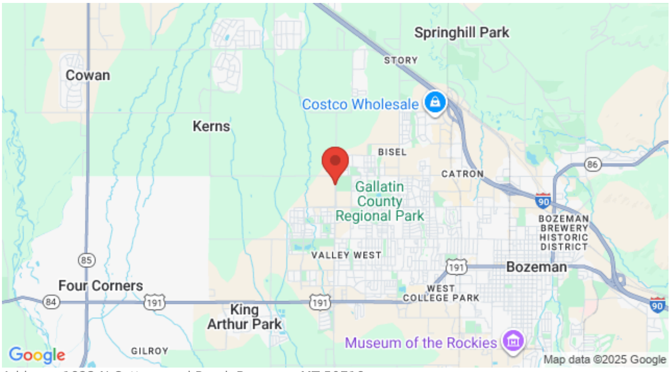
Address: 1823 N Cottonwood Road, Bozeman MT 59718