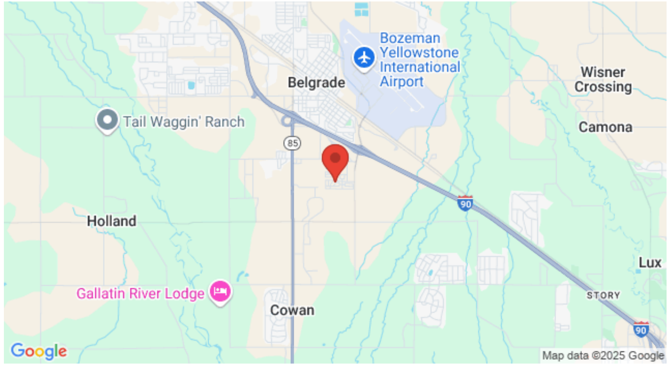
Address: 746 Thrice Loop, Belgrade MT 59714