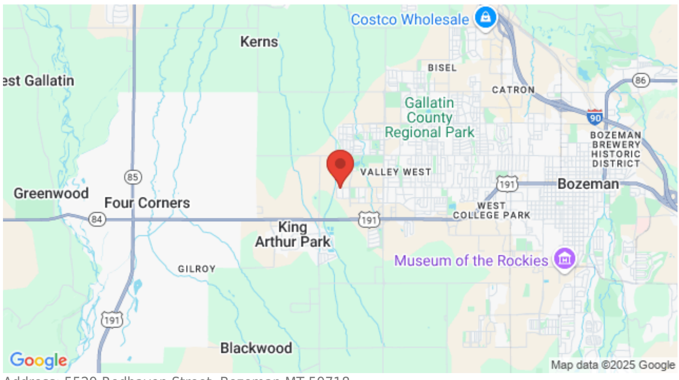
Address: 5529 Redhaven Street, Bozeman MT 59718