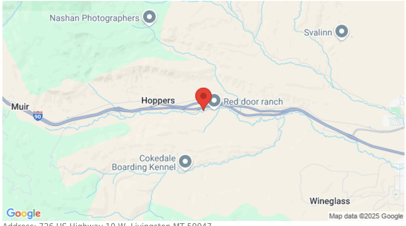
Address: 726 US Highway 10 W, Livingston MT 59047