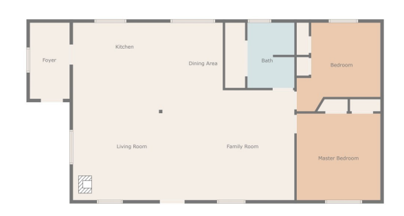
BIG SKY Hoor Flan Created by California App. Hoosuperments Deemed High's Reliable But Not Guarretoon