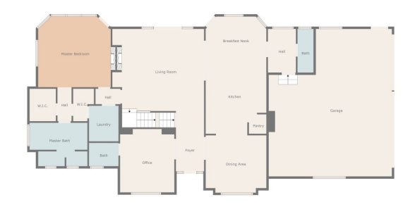
BIG SKY Hoor Flan Created by Colocula App. Hoosuverners Deermed High's Reliable But Not Guarretico.