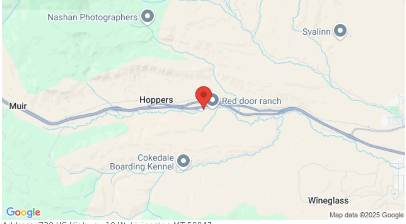
Address: 730 US Highway 10 W, Livingston MT 59047