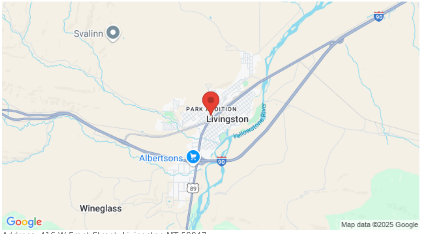
Address: 416 W Front Street, Livingston MT 59047