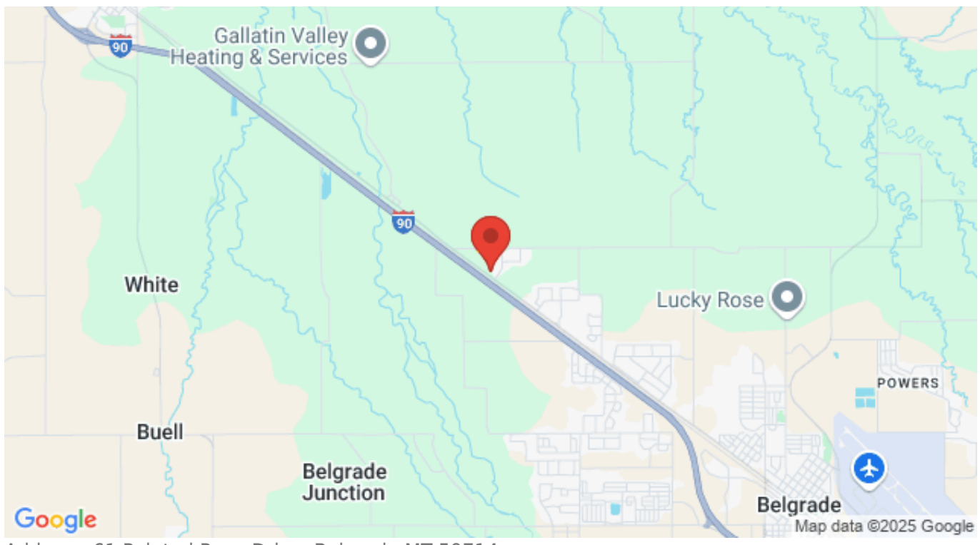
Address: 61 Painted Pony Drive, Belgrade MT 59714