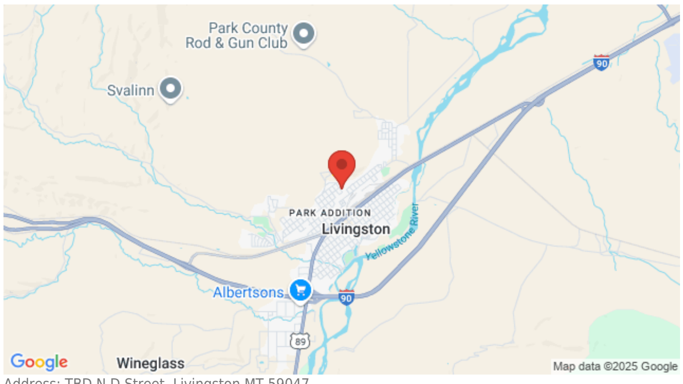
Address: TBD N D Street, Livingston MT 59047