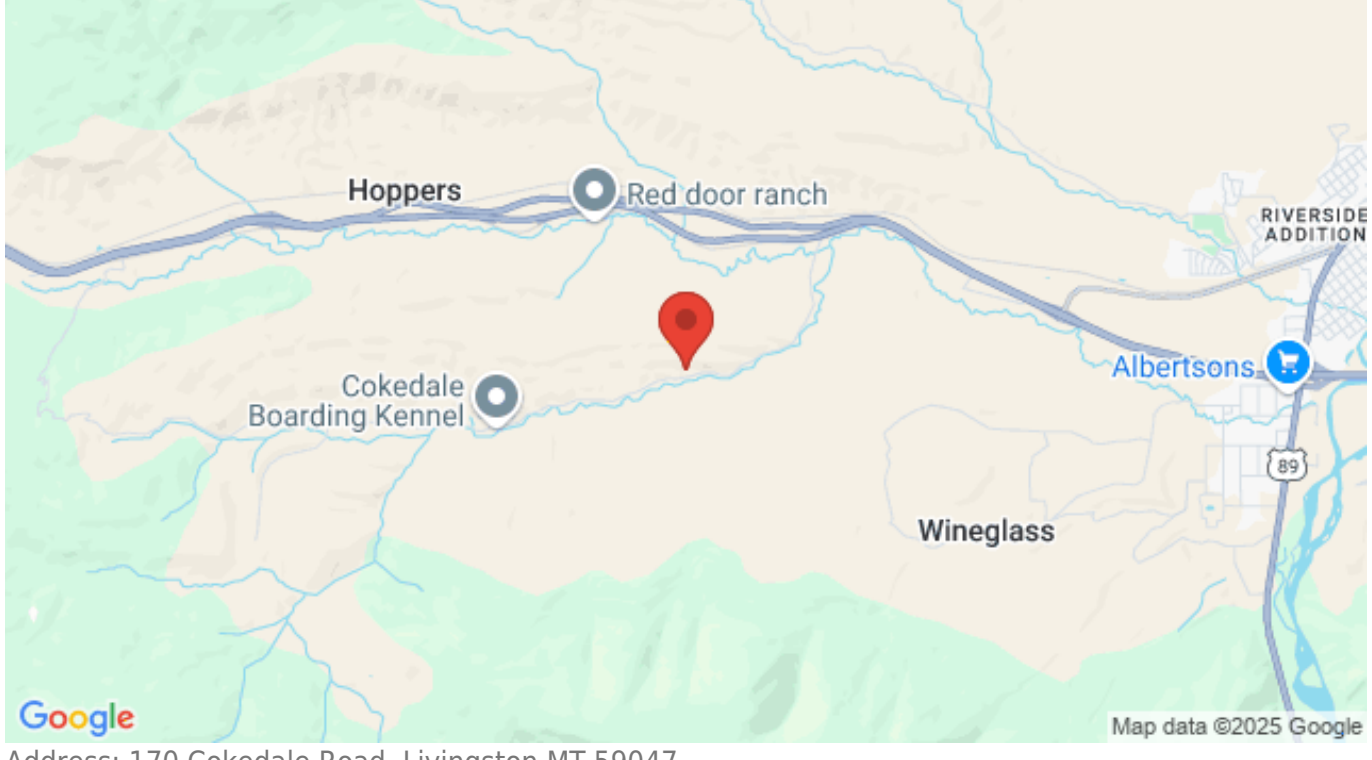
Address: 170 Cokedale Road, Livingston MT 59047