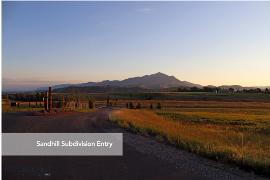
Sandhill Subdivision Entry