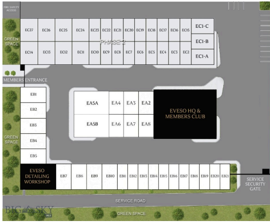
EVESO Bozeman General Montana, AC 49