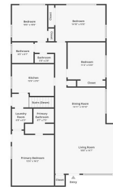
Floor 1 BIG SKY