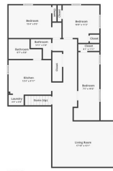
FLOOR 1 BIG SKY