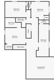
Basement BIG SKY