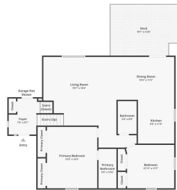
700 Mayfair Dr, Belgrade, MT 59714

Not guaranteed. Information provided for informational purposes only. Measurements are approximate, and square footage may include finished and unfinished areas.